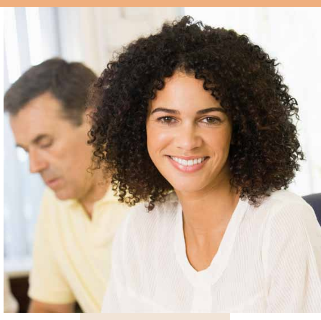
By the Editors of Kiplinger's Personal Finance